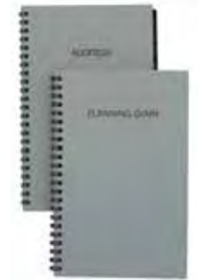
Two-Tone Desk A5TTS - Address Book