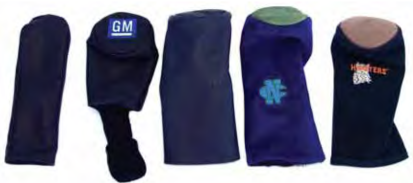
HCR HCS HCB HCBS