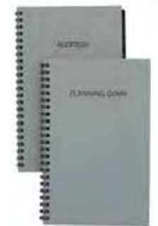
Full Wrap Compact A3FWS - Address Book